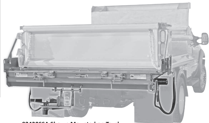
92420SSA Shown Mounted on Truck