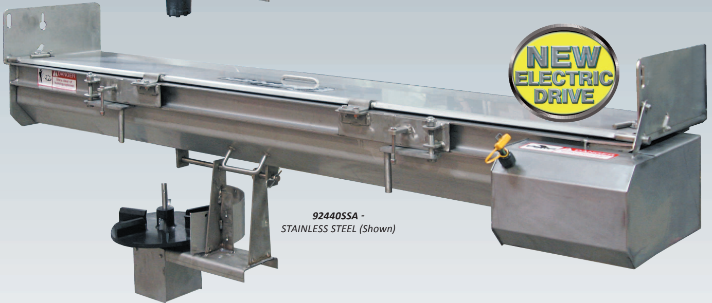
92440SSA - STAINLESS STEEL (Shown)